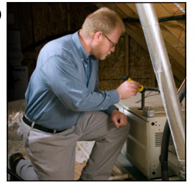
website at: www.alliedac.com

You can find out more details by calling our office or going to our